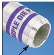
Corona Relief Taper